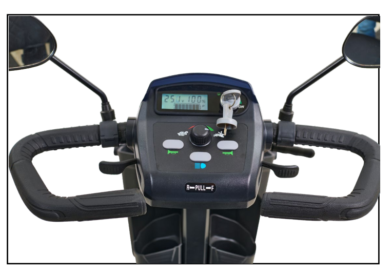
Digital Dash with Percentage Battery Life Indicator