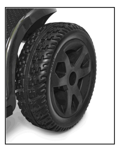
Sporty Black Wheels on Galactic Grey Models