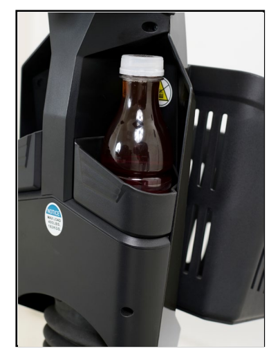
2 Convenient Drink Holders