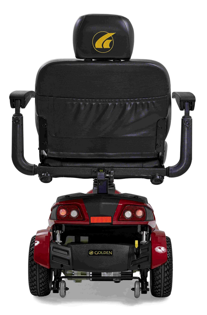
Rear Suspension for a Smooth Ride