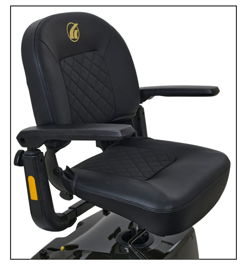
Luxurious High Back Stadium Seat with Quilted Diamond Stitch