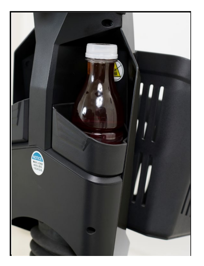
2 Convenient Drink Holders