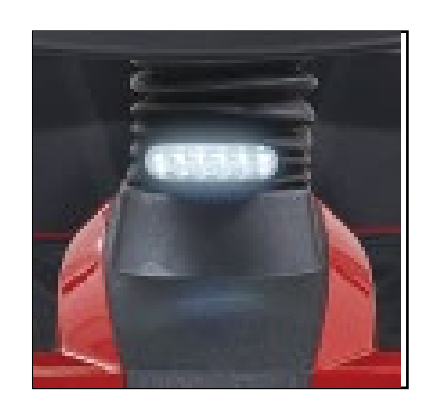
Front & Rear LED Lights & Side Reflectors for Safety