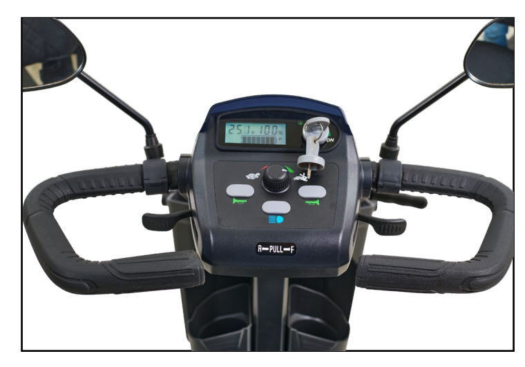
Digital Dash with Percentage Battery Life Indicator